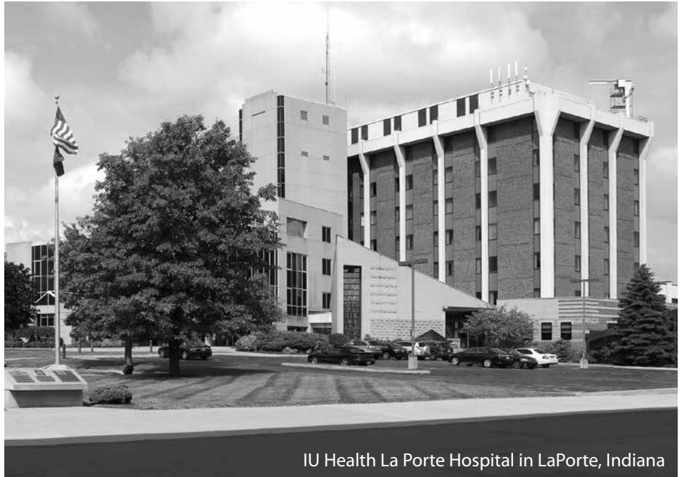
IU Health La Porte Hospital in LaPorte, Indiana

"One of the things I like most about our ED is that we are small. This allows us to know each other...It allows for a trust in the ED that may not be established in large facilities...Our medical staff is very supportive of us and help when they can, often