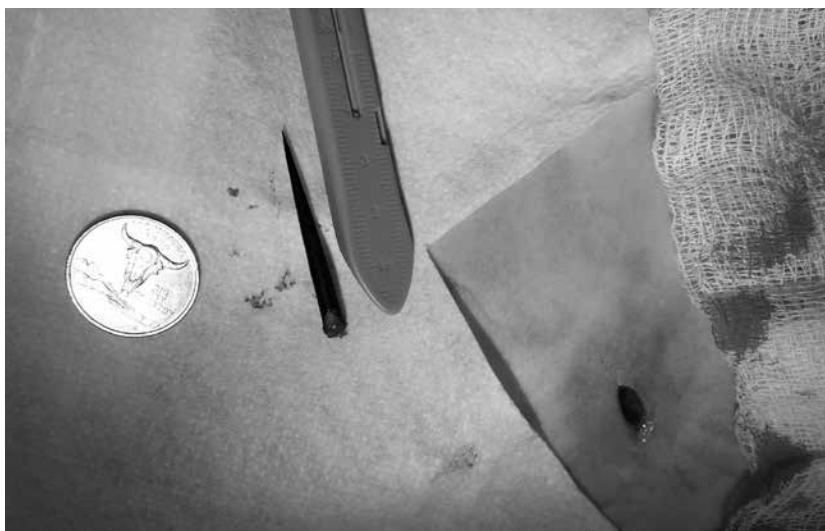
Figure 1. Honey locust thorn removed from patient's abdominal wall soft tissue. Quarter and scalpel ruler for scale.

The honey locust ( Gleditsia triacanthos ) is a woody, deciduous legume found nationwide capable of growing over 100 feet in height. Honey locust can produce large thorns on the trunk and branches strong enough to puncture tires. The honey locust is not a toxic plant, but thorn contact can result in slow healing wounds (USDANRCS, 2008). Thorns may grow up to 30 cm in length (University of Kentucky Department of Horticulture, 2015). Detection of thorns and other wood foreign bodies with plain radiography may be impossible after 48 hours due to fluid absorption. Ultrasound (US) is now commonly used to assess for nonradiodense objects and is often the imaging modality of choice due to its speed, lack of radiation, and portability. However, US can be limited in its ability to determine the objects position relative to deeper